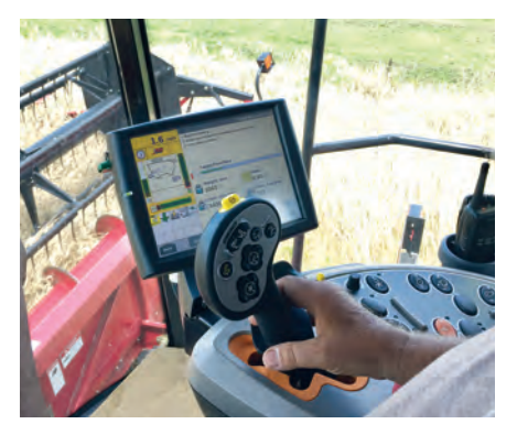
FIGURE 3. Calibration of the yield monitor is accomplished through the field computer in the combine. Refer to the machine's owner's manual for specific details on completing the calibration process.

Another sensor on the machine that affects yield monitor accuracy is the crop moisture sensor. Most machines