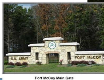
Fort McCoy Main Gate