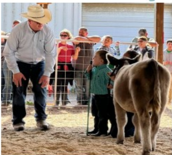
All Ages & Experience Levels