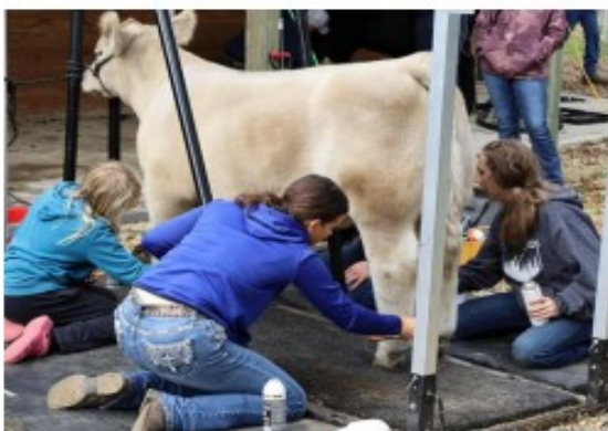
Hands On Learning