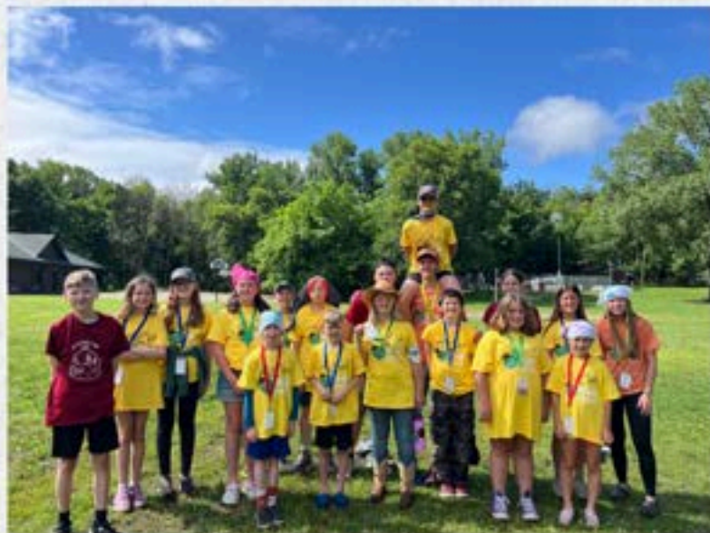
Northwest 4-H Golf Classic