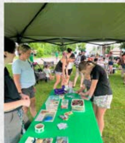
Baldwin Windmill Days