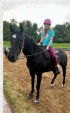
Horse Project Clinic